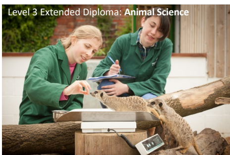
Level 3 Extended Diploma: Animal Science