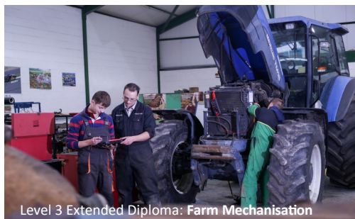
Level 3 Extended Diploma: Farm Mechanisation